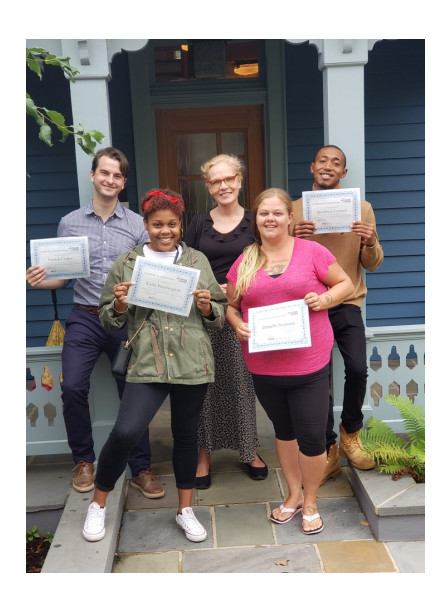
A Big Thanks to YOU

Job-Seekers: Since June of 2019 more than 250 job-seekers have been enrolled in Network2Work@PVCC. Below is a picture of our July 2019 Network2Work@PVCC Program Certificate graduates.